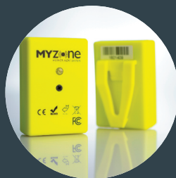
Receiver Unit MZ3Drx unit