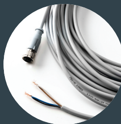
Power Cable with Connector MZPC10m