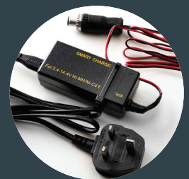
External Battery Pack Charger MZBCU01