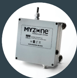
Transmitter Unit MZtxG2