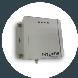
Transmitter Unit MZtxG3